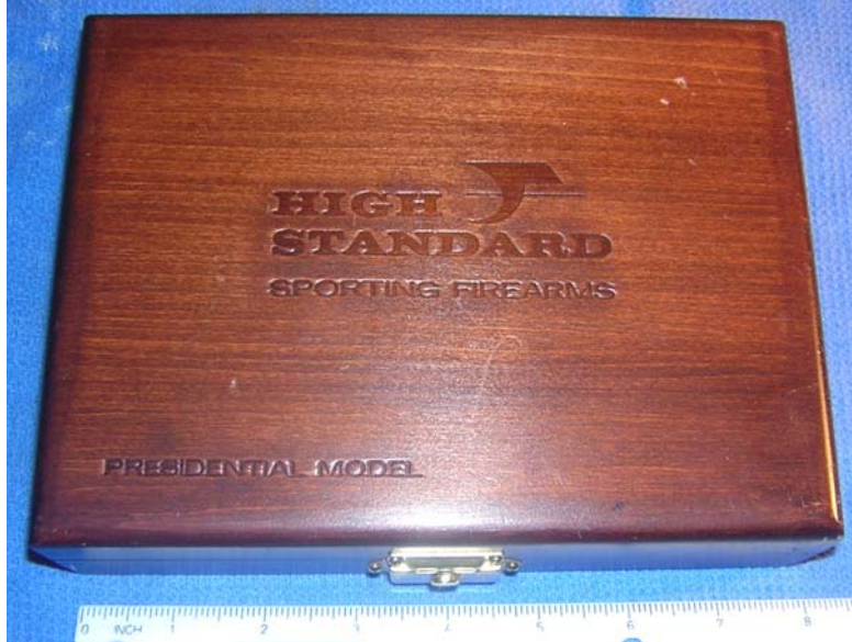
Derringer presentation case marked PREIDENTIAL MODEL for gold derringer s/n: DM-121. 22 Mag Model The derringer has no design series number or logo markings