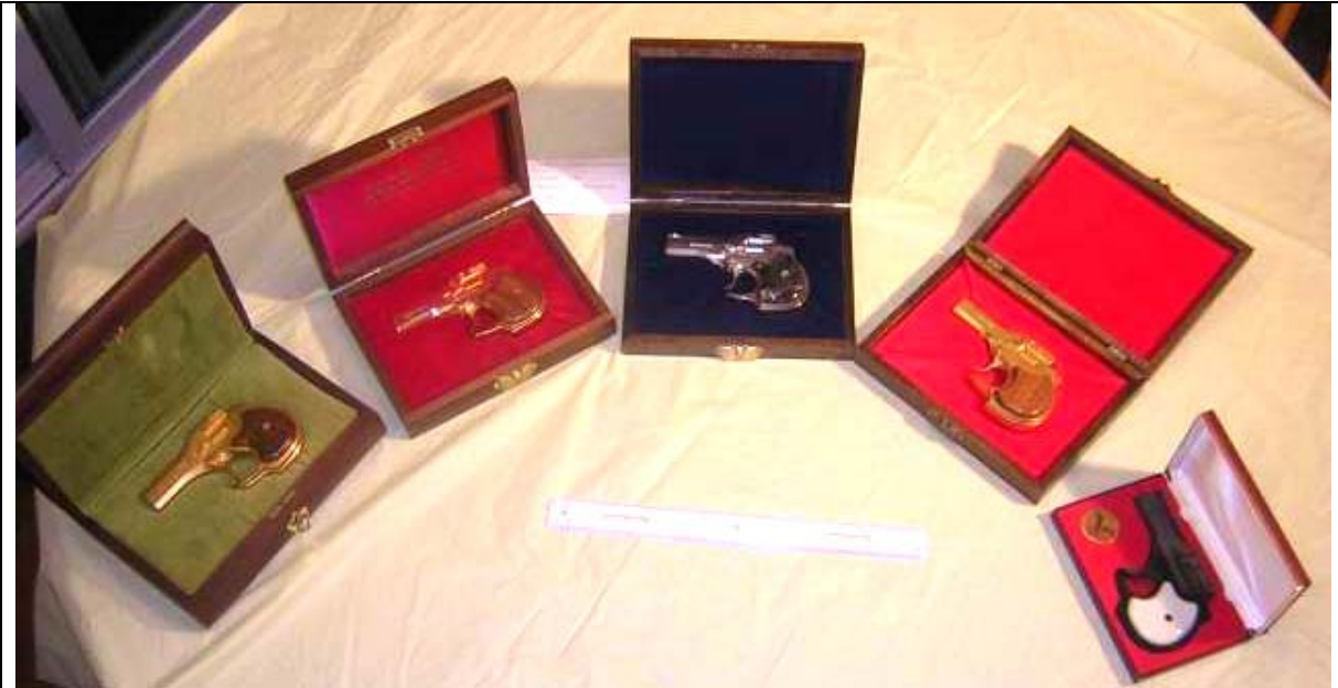
Derringers in cases - left to right - Gold derringer S/N 1,459,778, Presidential Model gold derringer s/n: DM-121 Silver derringer S/N SP-, Presentation Model gold derringer S/N GP-311, Blue derringer S/N 1,311,501 22 Mag in case with Eagle Logo and Model DM-101 markings

It is fun collecting these Derringers and the more common blue guns are still relatively easy to collect because some dealers have held the price on them well above the published gun book values. See Figures 5 & 6