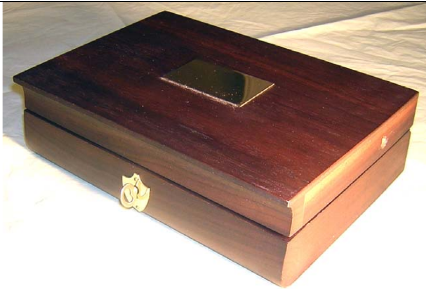
Derringer presentation case for gold derringer s/n: 1,459,778 01

I just acquired another gold plated Derringer. This one is a series one eagle logo 22 Mag in a beautiful walnut presentation case. This case is a little different than most of the other wooden presentation cases. This one has a contoured front panel and the lid has a brass plate on the lid for engraving purposes. See Figure 1 The interior is a lime green cloth covering a Derringer shaped depression in the case structure. These gold plated Derringers are getting harder to find all the time because there were not a lot of them manufactured (see John and Bill's entries on the HSCA website). This particular gun is also a little more unusual because it is serial #1,459,778 in the general production gun serial numbers for 1965. See Figure 2