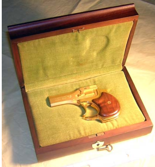
Derringer s/n: 1,459,778 in presentation case for gold derringer 22 Mag, with design series DM-101 and eagle logo markings