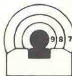
CORRECT SIGHT PICTURE